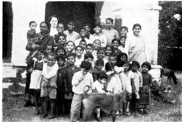
MAHOBA MISSION SCHOOL

We spoke to a third group in which there was a number of men with red marks on their foreheads showing that they had just been to the temple and that the priest had put the mark of the god they worshipped on their foreheads. How it stirred us to point them to One who alone is able to save them. We expected opposition from such ardent worshippers, but they stood in silence the whole time we spoke. Please pray for them and for us also so that we will have power to stir them up to seek the One who alone is able to give them the peace they are seeking. They do not look happy as they worship because of fear; and they always admit when we talk to them that they have not yet found the peace and joy they are seeking but they keep hoping they will find peace.