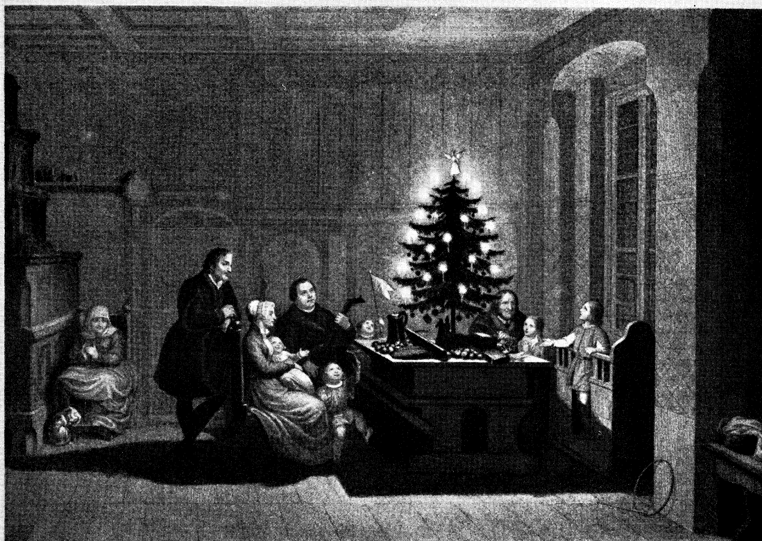
Christmas 1536 a.d.