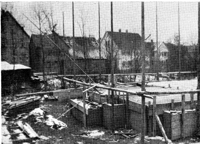
The Foundation of the New Kirchheim Church in Mid-December

The young man about whom we have written repeatedly who lost both hands in the last war is really a great blessing among the others. He is so earnestly seeking God and his testimonies are growing ever deeper. He prays so earnestly and cries out to God to fill Him with His spirit, and it is a spark and encouragement to our other young men and women. He says repeatedly that had he not lost his hands he would never have found His Lord and he considers his great handicap a blessing after all. His earnestness is a blessing to our own hearts.