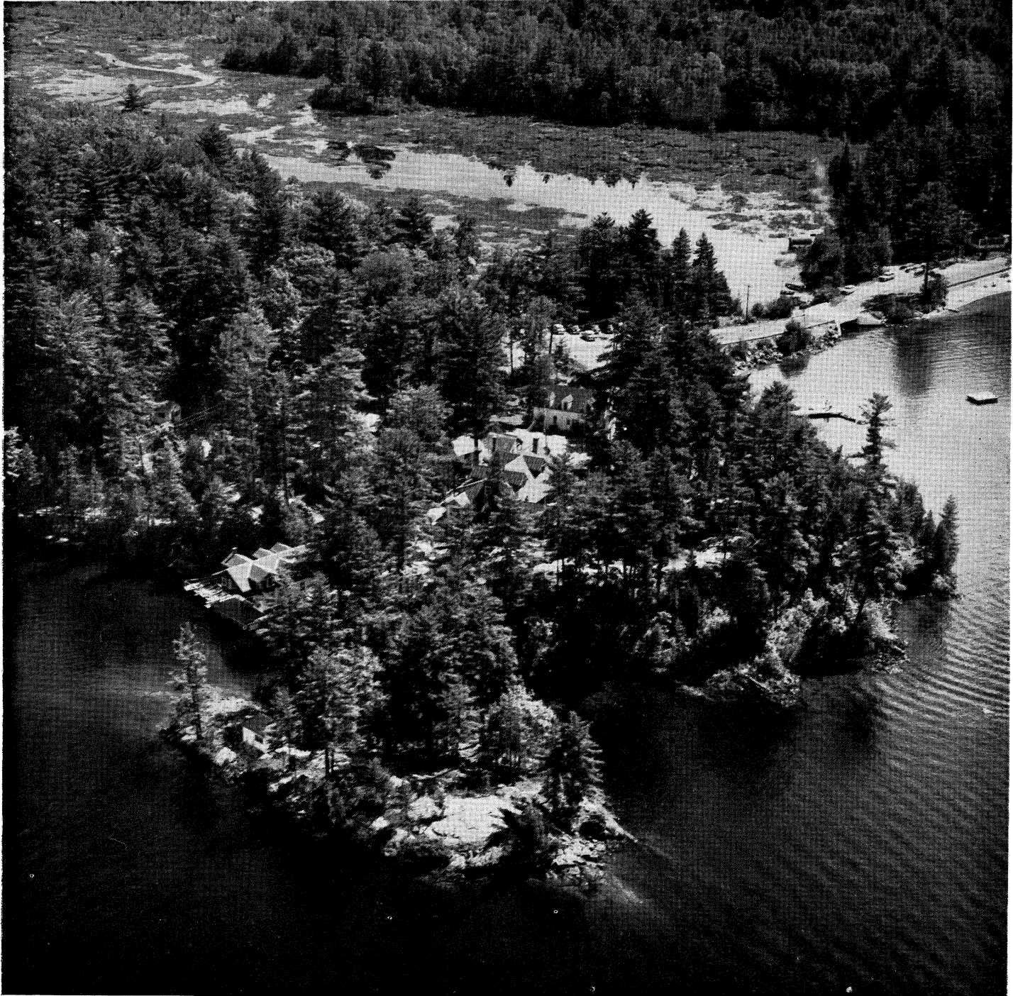
Aerial View of the Southern Part of Pilgrim Camp, Brant Lake, N. Y.