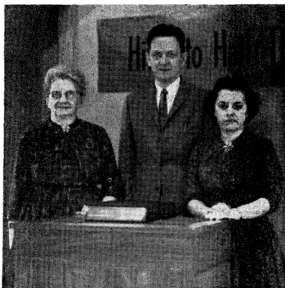
Ministers of the Williamsburgh Pentecostal Church