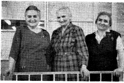
The Seed From Which This Tree Has Grown