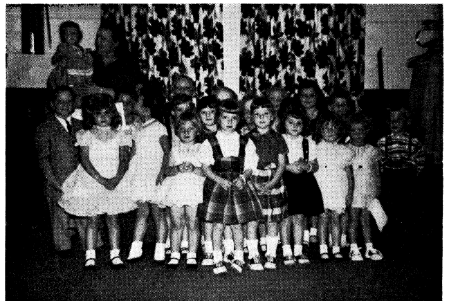
The Author with a Class of Beginners

To teach means to cause to know. If we would teach Beginners, we must be acquainted with their present knowledge, that it can be used as a foundation for the truths we wish them to grasp and understand. We must reach them through avenues with which they are familiar.