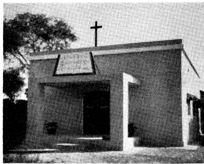
The new church, which measures 33 feet by 25 feet, has Matthew 1:21 as a motto over its front entrance (pictured above).