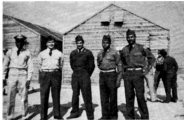
SOME MEMBERS OF PRAYER GROUP TOUL, FRANCE

This department is conducted in the interests of servicemen and will carry brief reports from them from time to time. If our readers would like to have BREAD OF LIFE sent to interested servicemen we will be glad to do so and to include their names among those who are regularly remembered in prayer. Reports from these for the paper will be welcomed.—Editor.