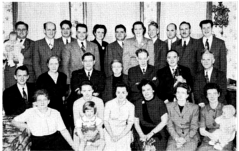
MINISTERS' FELLOWSHIP MEETING Woodhaven, N. Y., January 10, 1953