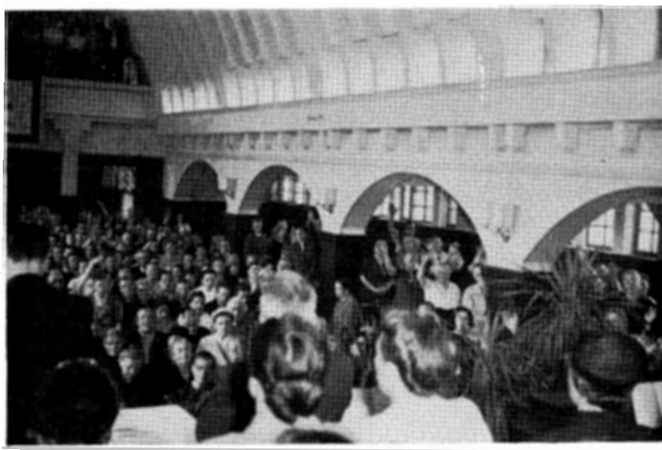
Kirchheim Bible Conference

It was very evident from the many testimonies that God is still true to His Word as He has always been. He that baptizes with the Holy Ghost and fire came Himself and walked in our midst. Many a heart was filled to overflowing and began to praise the Lord in new tongues. It almost seemed that we had