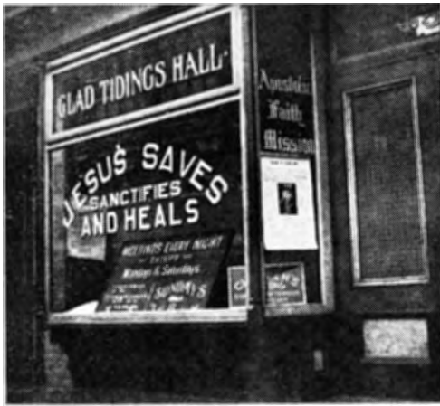
Glad Tidings Hall 454 West 42nd Street.

the baptism. The Volunteers of America, who were a few doors down in the same block, came to us and said, 'You might as well have our place. It's a little larger than yours. You take all the people, and we don't have anybody to come anymore. We're going to go.' We thought that was a pretty good idea, so we went down and rented the hall. It seated about 175, so that was quite a big move."