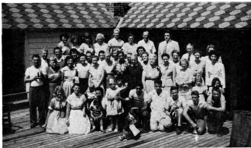
"They Come from the East and West They Come from the Lands Afar" to Pilgrim Camp

A never-to-be-forgotten night on Watch Rock left quite an impression on the adult campers. As they gathered for the week-