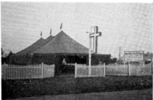
The Gospel Tent in Bowling Green, Virginia.

These typhoons always bring great sorrow to the people. There is so much need to help them. I am so sorry for them and pray that through this many will turn from idols to the true and living God.