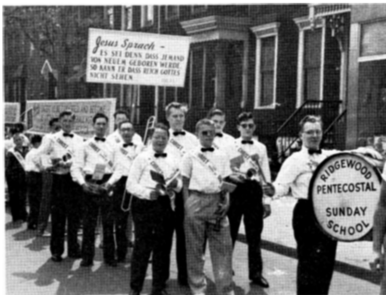
Ridgewood Pentecostal Sunday School Band and Some of Its Banners Anniversary Day Parade, June 7, 1956

A NNIVERSARY DAY is a Brooklyn holiday which commemorates the formation of the Brooklyn Sunday School Union in 1829. Each year on this day, the first or second Thursday of June, the members of the various Protestant churches and Sunday schools unite in giving testimony to their faith in the famous Anniversary Day Parade. Actually there are several divisions to this parade which march in their respective communities. "The New York Times" estimated that the total number of marchers for this year was 120,000.