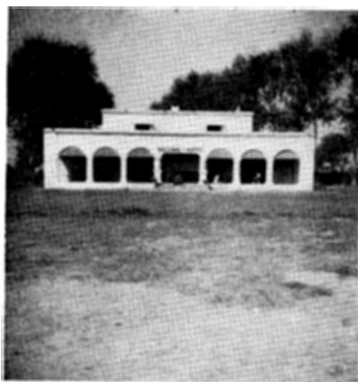
Katka Mission Bungalow

Finally, at ten the leader said, "Now, dear ones, it's ten o'clock and some of you will be wanting to go home, but those who wish to tarry still before the Lord,