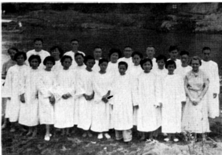
Baptismal Candidates at Pei-Tan