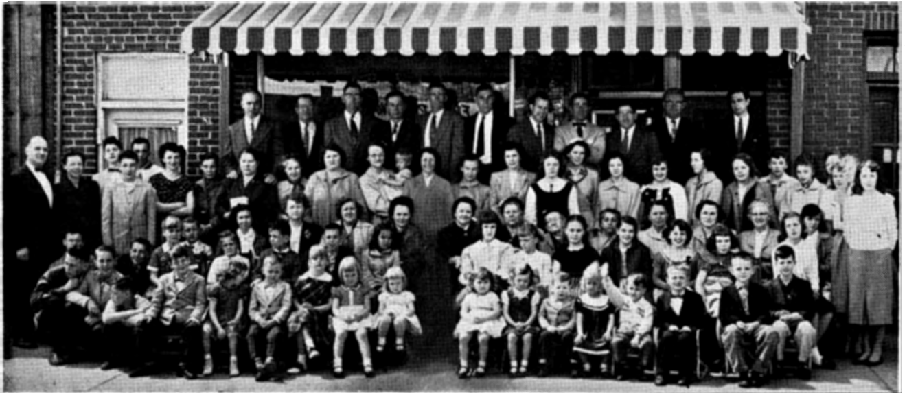
Congregation of the Fredericksburg Pentecostal Church, Fredericksburg, Virginia

This was true of my own experience after surrendering to the Lord, Jesus became very real as my indwelling Lord and King. I wanted more of Him and sought Him earnestly. One night in a young people's meeting of which I was the leader, I spoke glowingly of Jesus dwelling within and how our main need was simply to recognize Him within. Immediately aft-