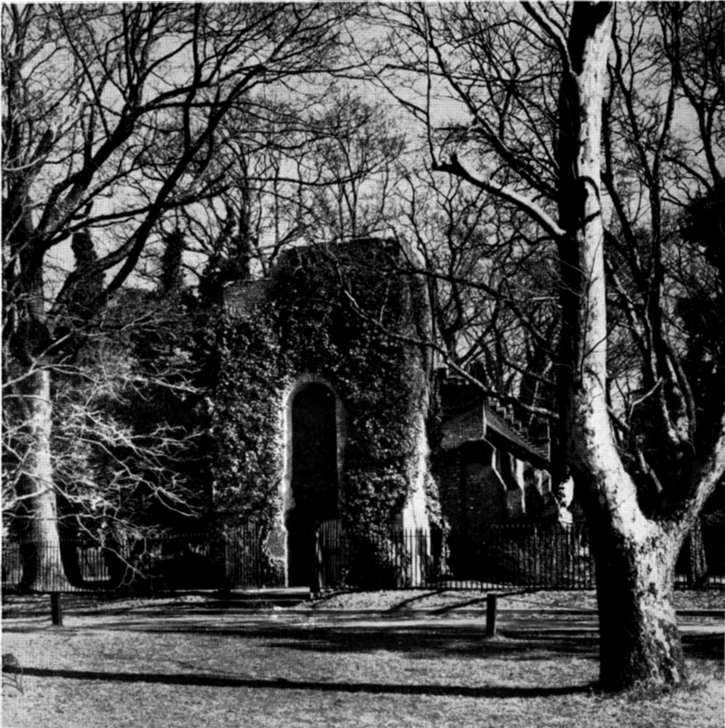
Episcopal Church Photo