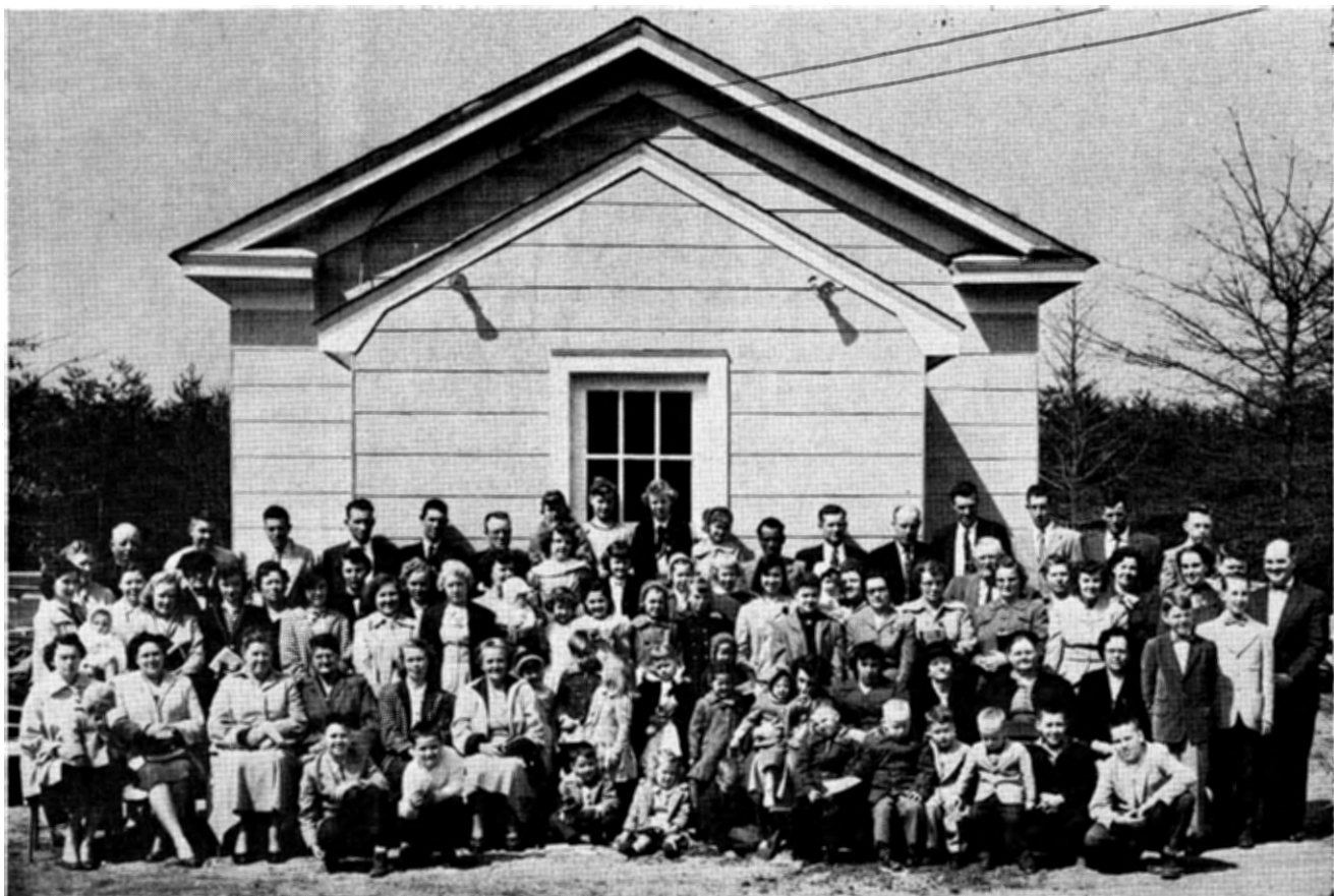
Forest Hill Pentecostal Church and Congregation

What gates are to a wall, so is praise to salvation.