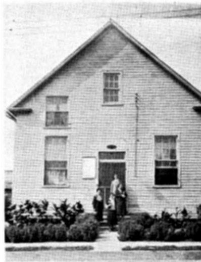
"The Glory Barn"

Within a few weeks we had electric lights put in and se-