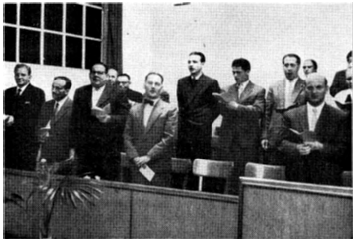
The Hamburg Conference Was International

We are also thankful for the ministry of the Word of God. We have seen people saved, enlightened, healed, and filled with