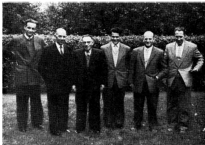
A Group of German Ministers at the Hamburg Conference

"Blessed are the poor in spirit." "Be ye clothed with humility." "Let every one of you esteem others better than himself." Where are we today? These things seem so simple and they seem so foolish. They do. And that proves that we are lost, that we are on the way of perdition, else they would seem jewels to be grasped after. "Thy words were found and I did eat