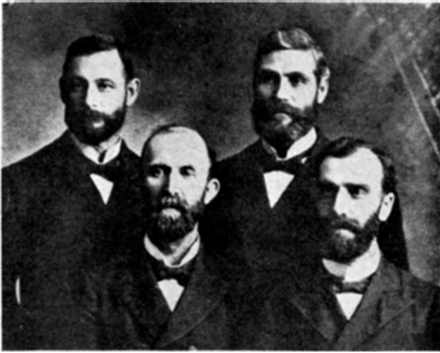
The Ohio Quartette