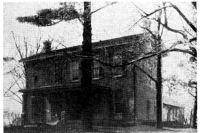
Gibeah Bible School, Plainfield, Indiana