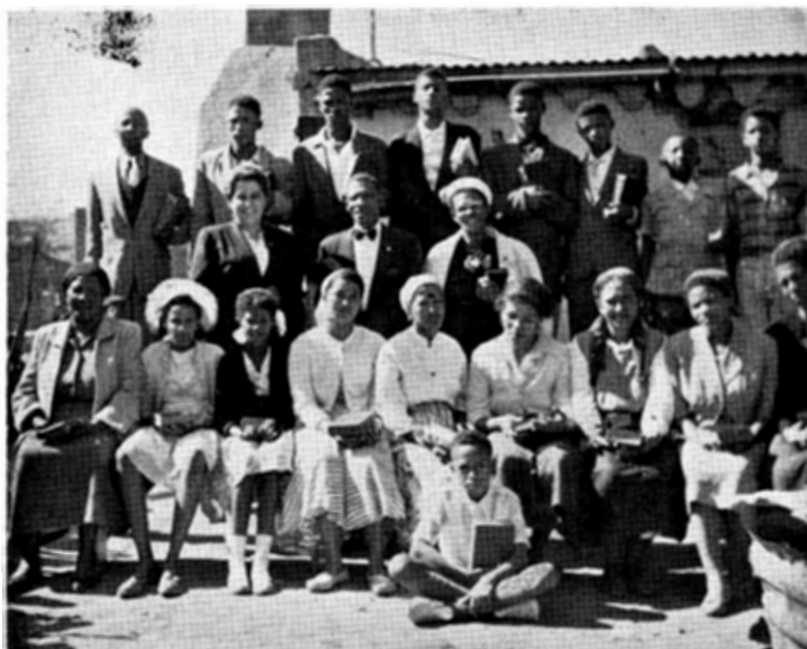
Adelaide Branch of the Assembly in Cradock, South Africa

“Our daily morning worship have had the touch of the Lord upon them and His presence is very near. I’m realizing more the importance of prayer as the base of supply for the Christian and the church. Cut off from it there is nothing but disaster. The Lord is seeing the desire of many hearts these days who want Him, our Jesus. We are still praying for a church or want to build, God willing, next year.”