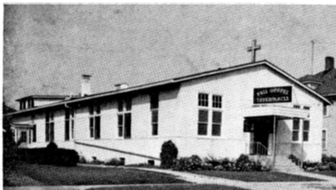
Full Gospel Tabernacle, Waukegan, Illinois

Originally a library building at the Great Lakes Naval Training Station, it was torn down, moved to Waukegan and rebuilt at 18 Philippa Avenue. Services were first held here in the summer of 1921.