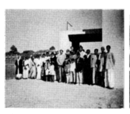
The congregation that gathered for the dedication services in the new church in Orai in December of last years