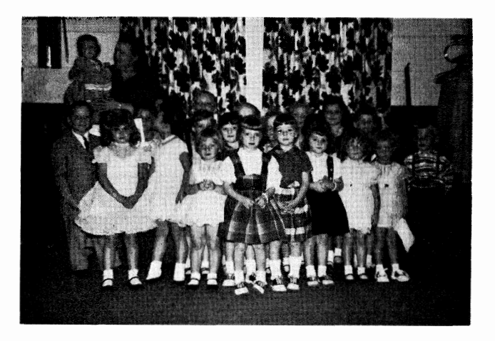
The Author with a Class of Beginners

To teach means to cause to know. If we would teach Beginners, we must be acquainted with their present knowledge, that it can be used as a foundation for the truths we wish them to grasp and understand. We must reach them through avenues with which they are familiar.