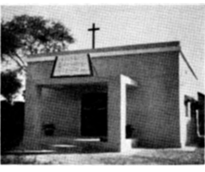
The new church, which measures 33 feet by 25 feet, has Matthew 1:21 as a motto over its front entrance (pic-tured above).