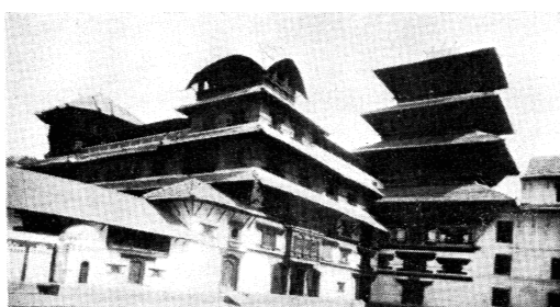
Above: An Old Nepal Palace Center: Five-storied Temple near Katmandu