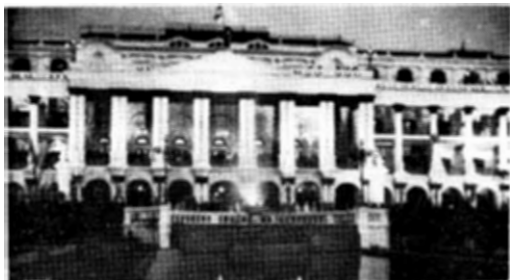
Singha Darbar (Lion Palace) Nepal Government Offices